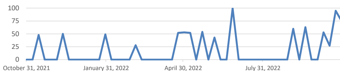
Figure 3. The trend of using AI techniques in the civil engineering