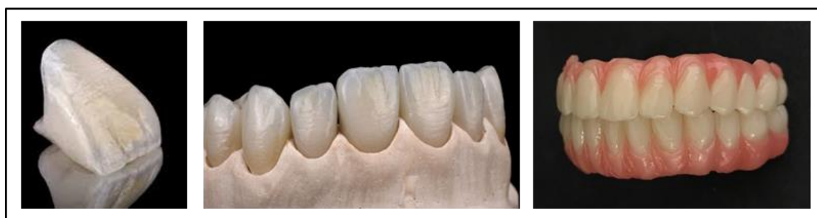
Fig. 4. Various indications of G-CAM disc

Glass ionomer cement is a tooth-coloured material and a major drawback of using rGO in dental materials such as GIC is its dark colour. Sun et al. attempted the addition of fluorinated graphene (FG) (Fig. 5) to conventional GIC which resulted in a compound that is white with significantly improved mechanical, tribological, anti-bacterial properties, enhanced Vickers hardness number (VHN), Compressive strength, and improved oral solubility [31]. The existence of fluoride ion ( F^- ) leads to the production of fluorapatite which because of its stable structure resists acid dissolution better than hydroxyapatite. Pure GICs have the highest accumulated F^- releasing in the early stage (during the first month), which is because of their fastest dissolution rate. The addition of FG decreased the solubility of the GICs composites, so F^- -releasing was relatively lower. The GICs/FG (4 wt%) composite had similar performance with other FG-added groups at initial stage, but then the F^- release increased rapidly due to the accelerating of dissolution. Soon the GICs/FG (4 wt%) composite has the most F^- releasing [31]. Sharafeddin et al in their study reported that the addition of GO to CGIC has no significant effect