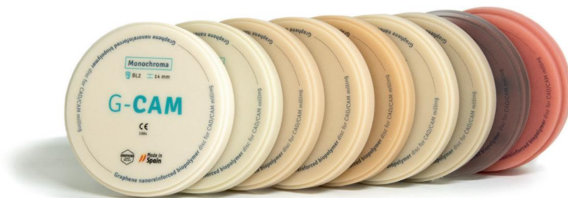
Fig. 3. Various available shades of the G-CAM disc