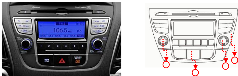
Fig11. Priority of applied texture on car console