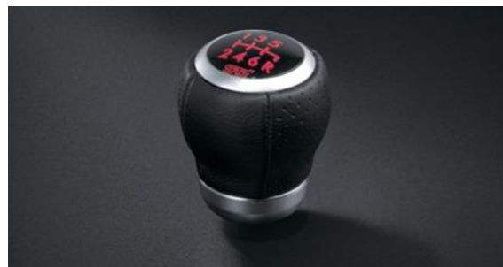
Fig6. Applying texture on interior components decreases glossiness, which leads to a vivid vision when looking at the buttons