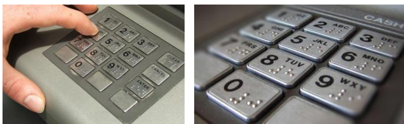
Fig1. Texture applied to ATM for blind person

• Another reason in choosing texture patterns for a product is given personality to it. Deciding on a texture pattern for a product can be carried out in a way that attributes the product to a particular group of people or reminds a specific lifestyle (Figure 2-4).