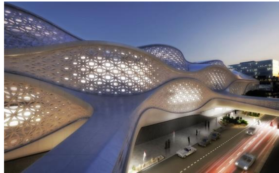
Fig3. Zaha Hadid separates space by texture and this usage of textile influences lighting