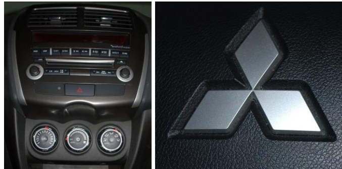
Fig9. ASX Console and knobs